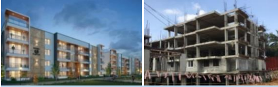
Esteem Kings Court – J P Nagar

Esteem Kings Court being our 2 nd project in a row by M/s Esteem Mall LLP. The 2,90,000 sq.ft building includes 7 towers that comprises of basement, ground floor and 4 typical floors. This project is located in J P Nagar, one of the posh residential area in South Bangalore.