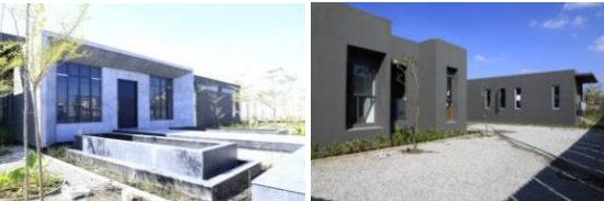
Assetz Canvas & Cove - Begur

The residential project, consisting of 2 phases, has commenced its construction of Phase 1 in December 2019. Highly skilled employees have been commissioned responsible for effective and timely completion of project within the schedule.