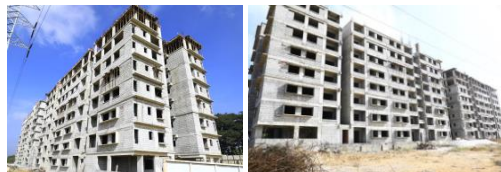
BSCPL Chalet – Doddabalapura

This 1,80,000 sq ft. residential building by BSCPL Infrastructure Limited is another addition to our achievements. The project comprises of basement, ground floor and 7 typical floors.