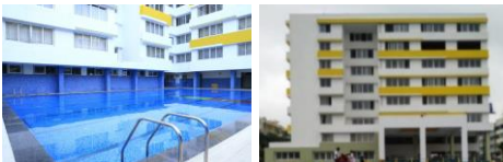
Vibgyor High School – HSR Layout

Transatlantic has marked its strong existence in the Construction biz of India. Within 2 years of initiating, we have grounded a successful track record with the completion of 1,80,000 sq ft. institutional project which consists of basement, ground and first floor. It was efficiently handed over in a span of 12 months.