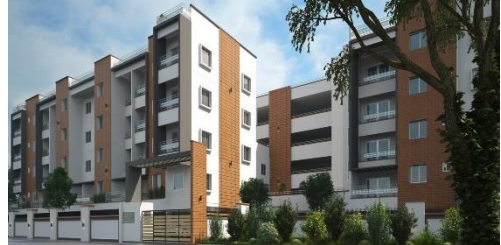
Esteem Ramaiah Apartments - Mathikere

With proper planning and with our team's finest workmanship, this project was handed over within the set schedule and with the appreciated standards.